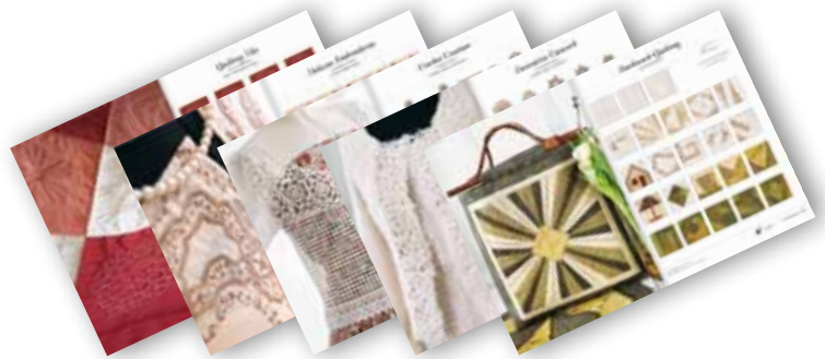
Featured above: 226, 232, 234, 235 and 238

Browse and search the online catalogue with all available embroidery collections from HUSQVARNA VIKING®. Click on tell a friend to share this catalogue with everyone interested in embroidery or use many other functionalities available!